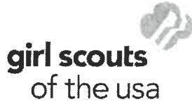
Exhibit C – Notice of Rules