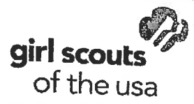
Exhibit C – Notice of Rules

Entered: Scanned: eBuilde Ready: Website Ready: